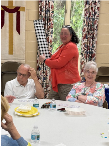
Winners and losers