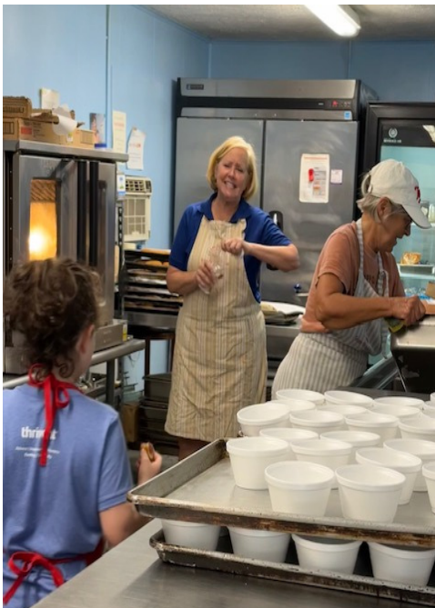
More Manna House